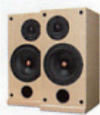
STEREO SPEAKERS ProAc Response D Two £1750 Page 79