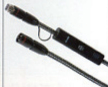
INTERCONNECT CABLE Audioquest Niagara XLR £980/metre Page 81