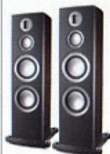
STEREO SPEAKERS Monitor Audio Platinum PL300 £5000